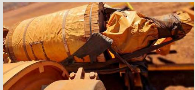
Images: LDPE Sheet Decomposition