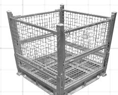
13-PSS700C/INT/GAL 950mmL x 950mmW