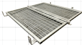
13-PSS/INT/L 950mmL x 950mmW