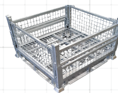
13-PSS350C/INT/GAL 950mmL x 950mmW