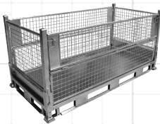
13-PSS800/2200/C/INT 1097mmDx 2222mmW

Not limited to these options, please contact Daywalk