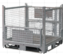
13-PSS800/1160/SC 1160mmL x 1160mmW