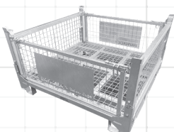
13-PSS400/1160/SC 1160mmL x 1160mmW