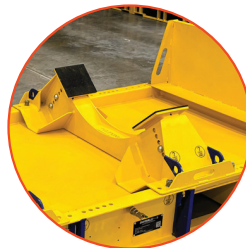
ADJUSTABLE CHOCKS WITH ANTI-SLIP RUBBER