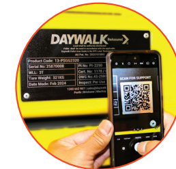
QR GUIDANCE & SUPPORT