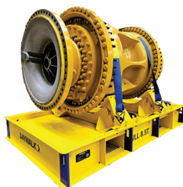
785 FINAL DRIVE

Not limited to these options, please contact Daywalk