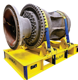
789 FINAL DRIVE