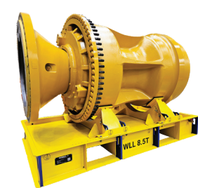
793 + EXT FINAL DRIVE

DISCLAIMER: For specific lashing guidance, refer to the load guide with each frame. Images are representative only.