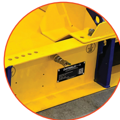
CENTRALISED BUNG FOR DRAINAGE