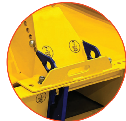
ELEVATED LASHING LUGS