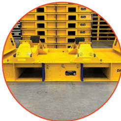
TARE WEIGHT FORK POCKETS