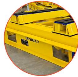
WIDE FORK POCKETS