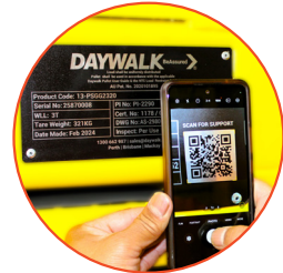
QR GUIDANCE & SUPPORT

COMPATIBLE WITH MOTORS AND ALL FLAT BASED STABLE ITEMS