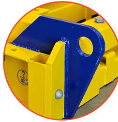
RATED ELEVATED TRUCK LASH POINTS