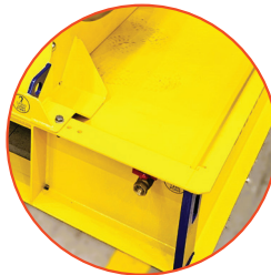
DRIP TRAY W/DRAINAGE