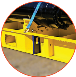
EXTERNAL 'TRUCK LASHING' LUGS