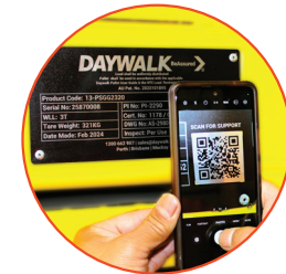
QR GUIDANCE & SUPPORT