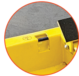
INTERNAL LASHING LUGS