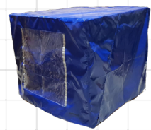
13-PCPI800P 1200mmL x 1200mmW x 1050mmH