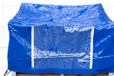
13-PCPI500P 1200mmL x 1200mmW x 600mmH