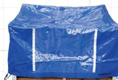
13-PCPI500P 2320mmL x 1500mmW