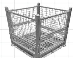
13-PSS700C/INT/GAL 950mmL x 950mmW