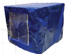
13-PCPI800P 1160mmL x 1160mmW