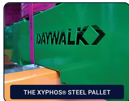
THE XYPHOS® STEEL PALLET