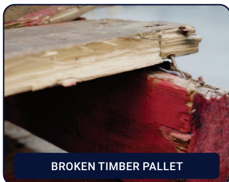
BROKEN TIMBER PALLET

Lasting up to 3-5 years as compared to the typical 1-year lifespan of hardwood pallets, XYPHOS® is more cost-effective and durable than any other pallet